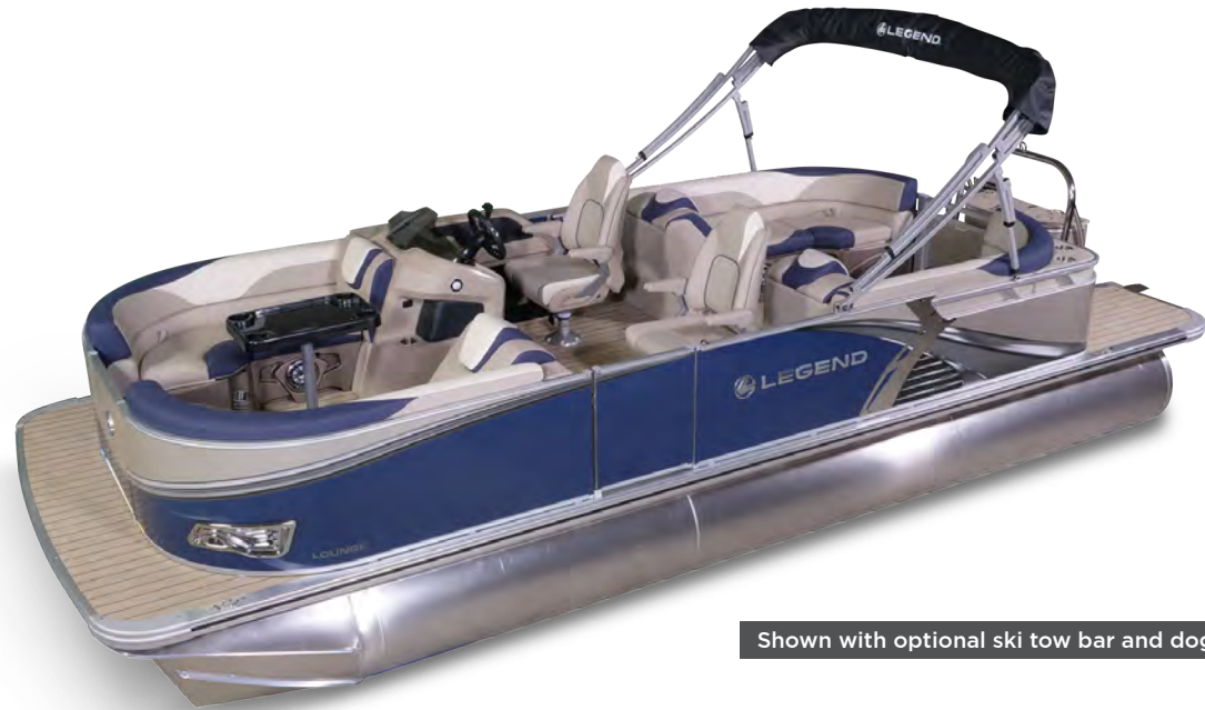
Shown with optional ski tow bar and dog house.