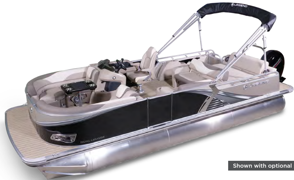
Shown with optional ski tow bar.