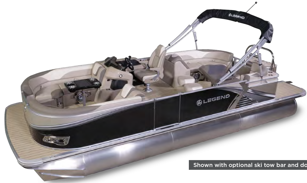
Shown with optional ski tow bar and dog house.