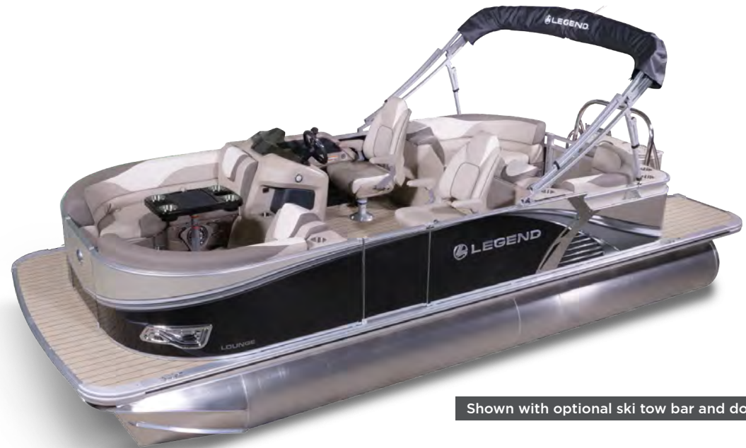
Shown with optional ski tow bar and dog house.