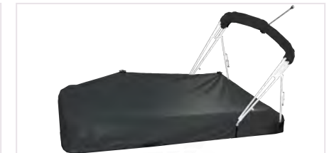
Add a Mooring Cover

Looking for more information? See: Pontoon Boats Accessories | PG 61