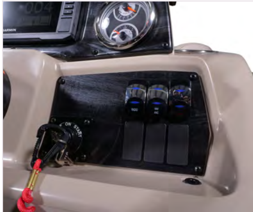
Key-start ignition, and light switches, all in one place.