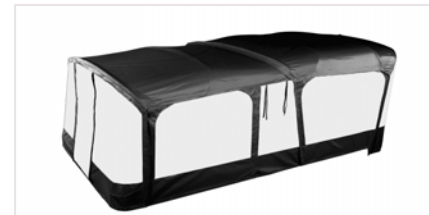
Add a Full Enclosure