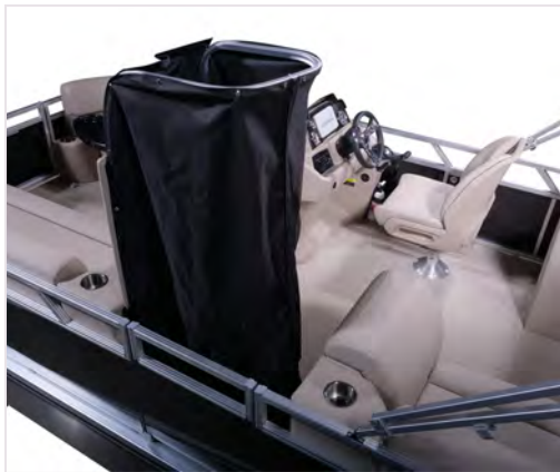
Hidden pop-up change room provides privacy to get changed for a dip in the lake.