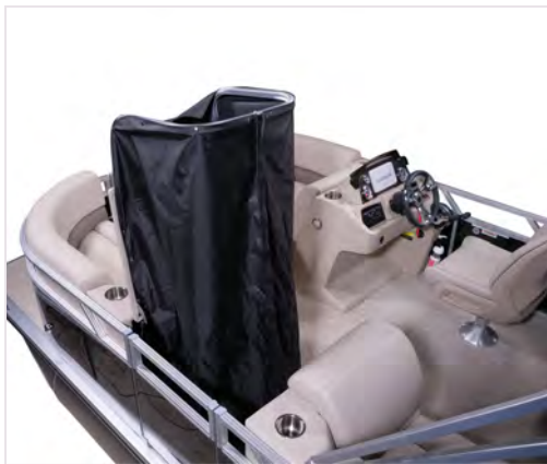
Hidden pop-up change room provides privacy to get changed for a dip in the lake.