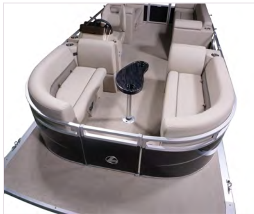
Seat up to 4 of your favourite people in the forward lounge.