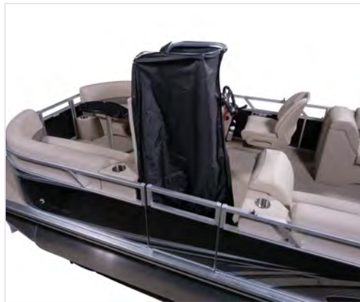
Hidden pop-up change room provides privacy to get changed for a dip in the lake.