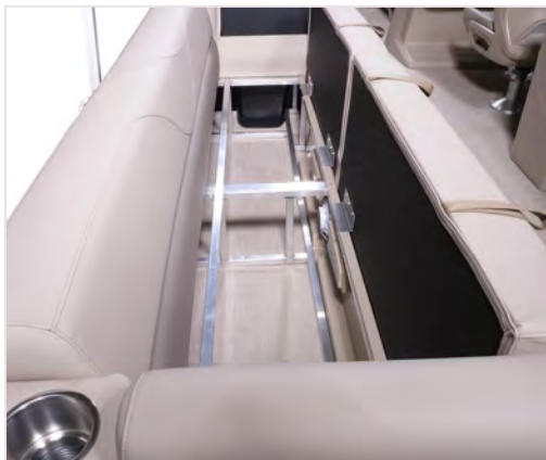
Find enormous amounts of hidden storage space under all 4 couches.